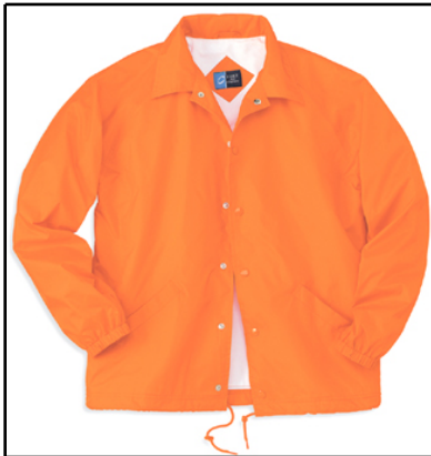
Port & Company - Sideline Jacket. JP71

On or off the field, this versatile nylon jacket can accommodate your plans. It has nylon-lined sleeves for easy on and off, a locker loop, slash pockets, elastic cuffs, inside pocket with Velcro closure, drawstring bottom hem and raglan sleeves.