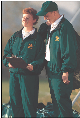
Port Authority - Washer Nylon Full Zip Front Jacket. J745

Available colors: Black, Dark Navy, Goldenrod, Hunter, Orange, Red, Royal