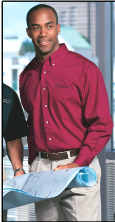
Port Authority - Long Sleeve Twill. S600T

This classic button-down is perfect for a corporate or casual situation. This shirt has fine details like double needle stitching for added durability, patch pocket, button-down collar, button-through sleeve plackets and adjustable cuffs for a comfortable fit. It has extra horn tone buttons for your convenience.