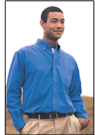
Port Authority - Long Sleeve Weathered Twill. S605

This classic twill button-down is perfect for a corporate or casual situation. This shirt has fine details like double needle stitching for added durability, patch pocket, button-down collar, button-through sleeve plackets, and adjustable cuffs for a comfortable fit. It has extra horn tone buttons for your convenience.